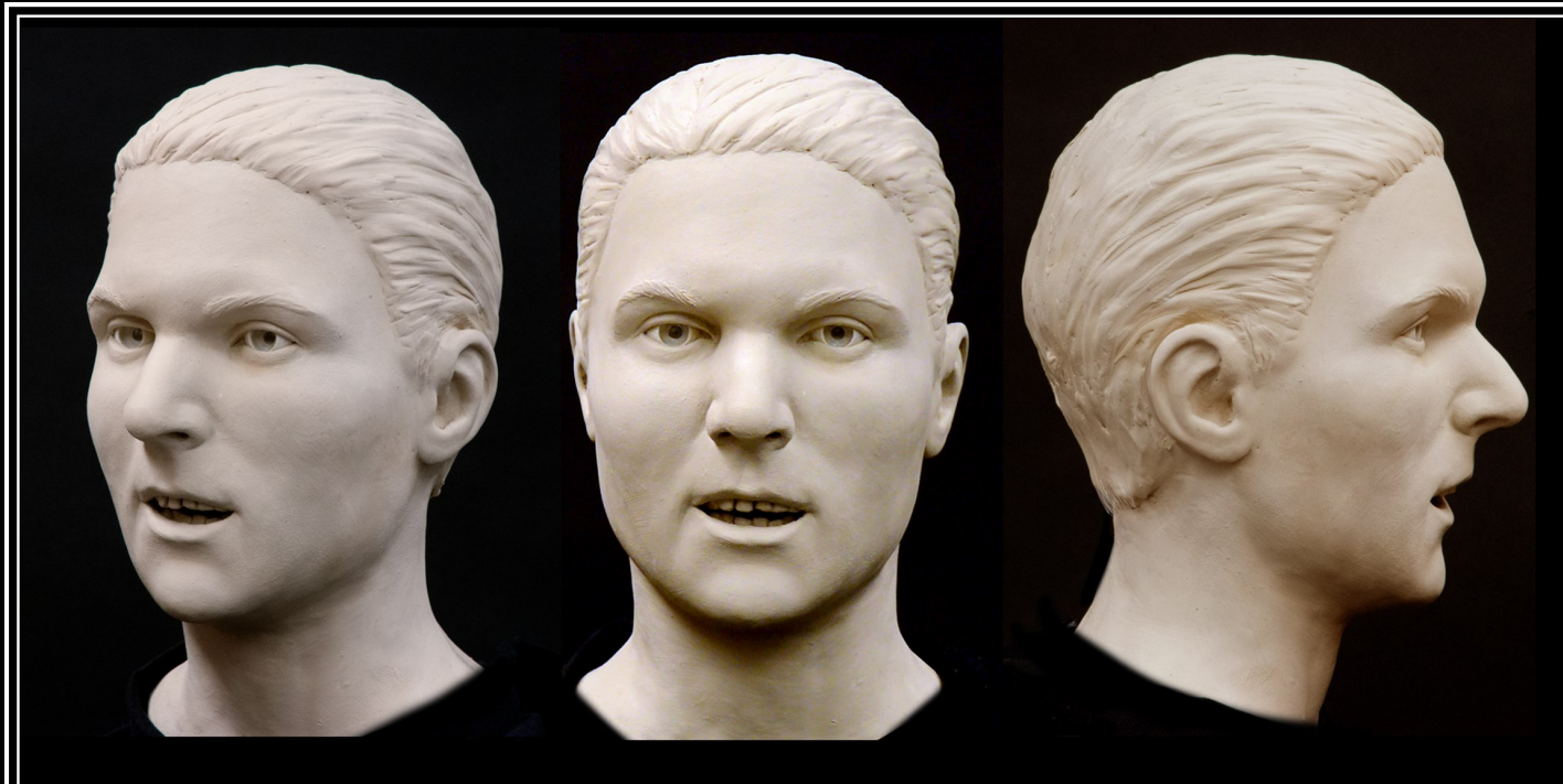
Artist depictions of what the victim may have looked like.