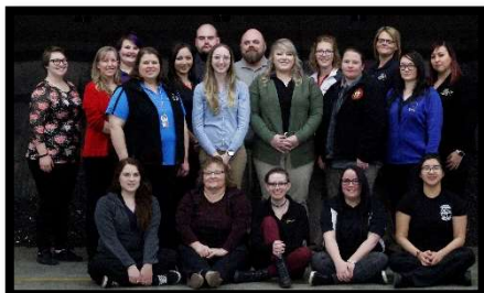
60 th Session February 25 - March 8, 2019