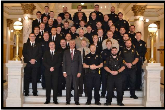
168 th Session August 21 – November 17, 2017