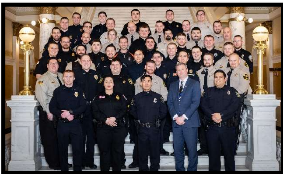
169 th Session November 27, 2017 - March 2, 2018