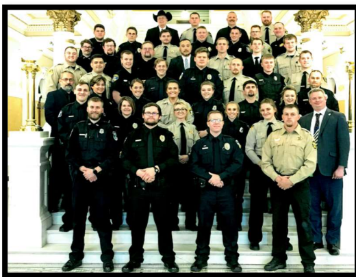
170 th Session March 12 - June 8, 2018