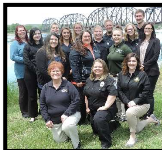
61 st Session June 3 - 14, 2019

911 Telecommunicators Certified ..... 55