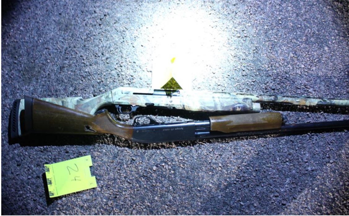
Two 12-gauge shotguns recovered by DCI Agents at the scene possessed by Jondahl.