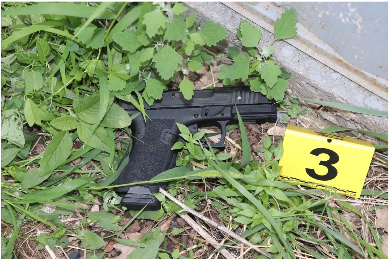
Below: Kilbourn's firearm confirmed to be loaded.