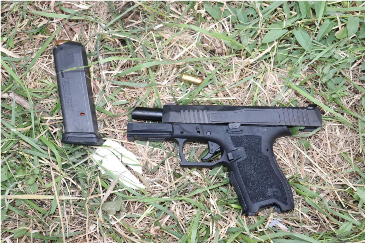
Above: Kilbourn's firearm next to the shed.