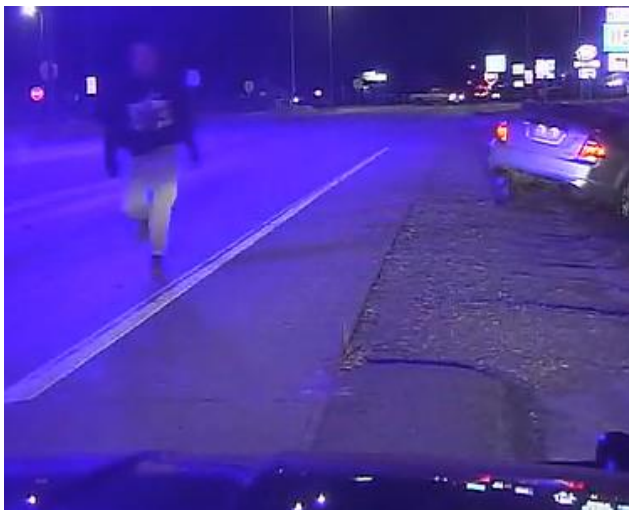
Still shot from SDHP dashcam of Bershad running toward the Trooper.