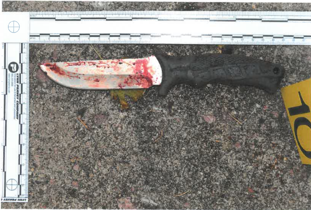
Photographs of Scene at 440 S Garfield Ave (152)