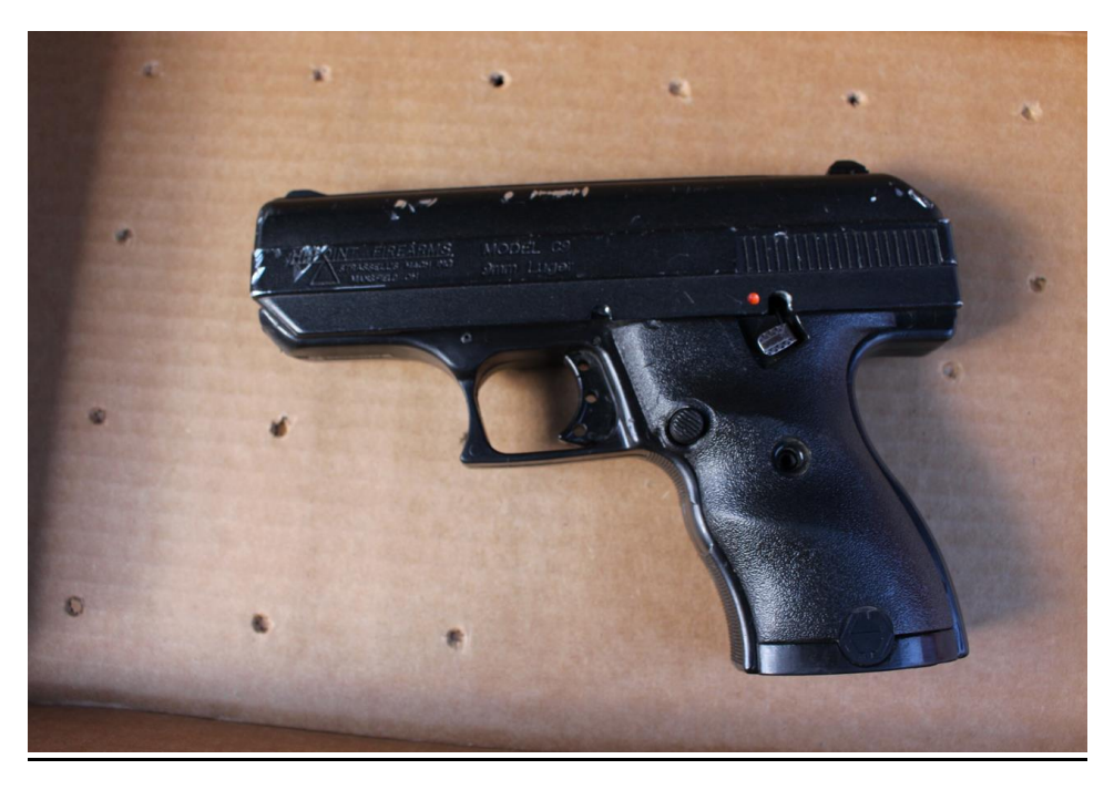
Photo of 9mm Hi-Point pistol possessed by Warbonnett and recovered on scene.